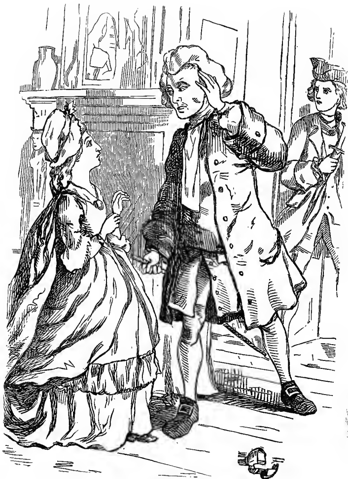
The Tutor in Trouble.